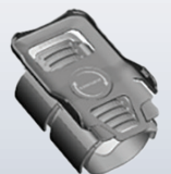
• Wearable Holder