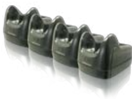
Four Slot Dock (Optional Ethernet Connection)