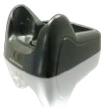
Single Slot Dock with Spare Battery Slot (Opt. Ethernet or Modem Connection)