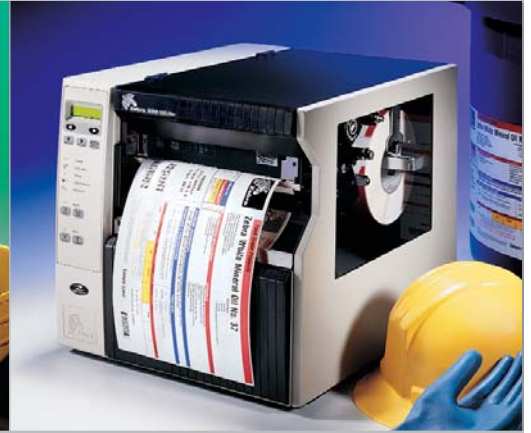
220XiIIIPlus™ 203/300 dpi

In North America, the 170XiIIIPlus has an RFID Ready option that allows you to upgrade to RFID technology in the future.